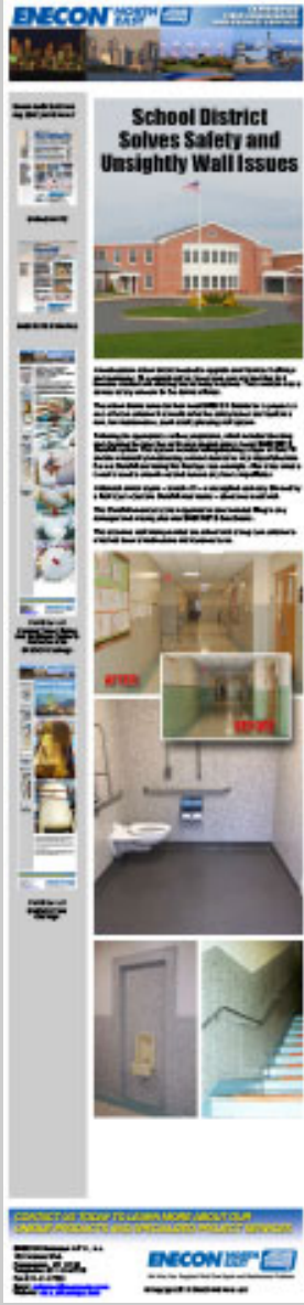
Vol 10 Issue 7 School Solves Unsightly Wall Issues