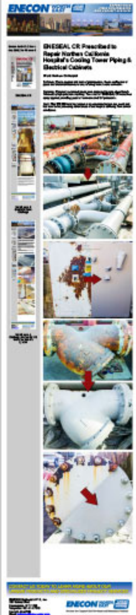
Vol 10 Issue 6 Cooling Tower Piping and Electrical Cabinets Protected with ENECON Coatings