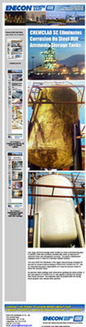
Vol 10 Issue 5 ENECON Tank Coatings