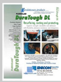
FLEXICLAD DURATOUGH DL

Enecon North East News Dec. 2017 | Vol 10. Issue 1