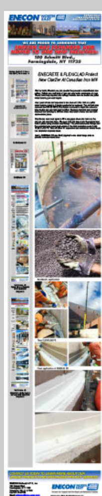
Vol 9 Issue 14 ENECON Coatings Protect New Clarifier At Canadian Iron Mill