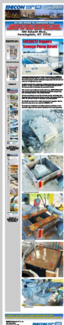
Vol 9 Issue 13 Pump Bases Rebuild With ENECON Polymers

CONTACT US TODAY TO LEARN MORE ABOUT OUR UNIQUE PRODUCTS AND SPECIALIZED PROJECT SERVICES