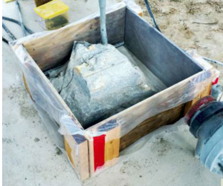
Former with plastic sheeting.