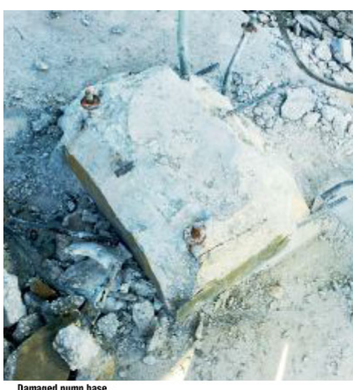
Damaged pump base.

The project was completed to the facility engineer's satisfaction on time and under budget and well within the mandated D.E.P. permit guidelines.