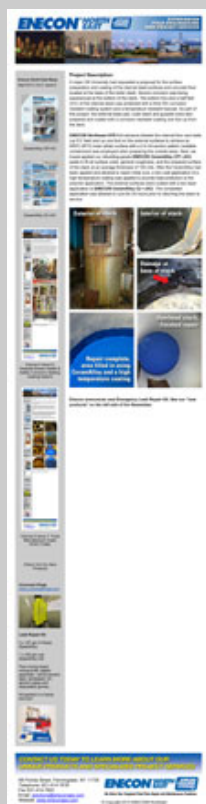
Volume 5 Issue 9: University Boiler Stack Repaired & Coated