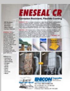
Enecon Eneseal CR