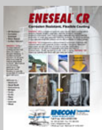
Ene seal CR