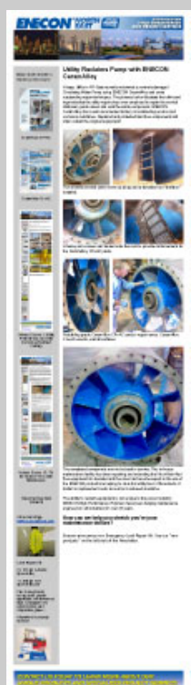
Volume 6 Issue 2: Utility Reclaims Pump with CeramAlloy