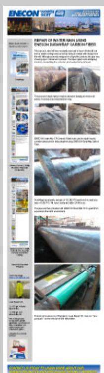
Volume 6 Issue 3: Steel Mill Water Main Repaired Using Durawrap