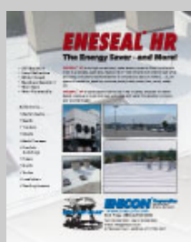
Ene seal HR

Enecon North East News Mar 2014 | Vol 6, Issue 4