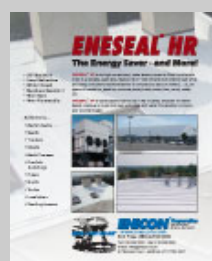
Ene seal HR

Enecon North East News April 2014 | Vol 6, Issue 4