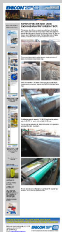
Volume 6 Issue 3: Steel Mill Water Main Repaired Using Durawrap