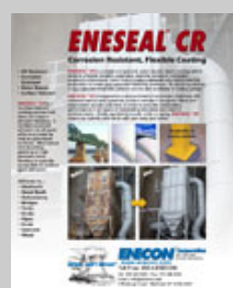
Ene seal CR