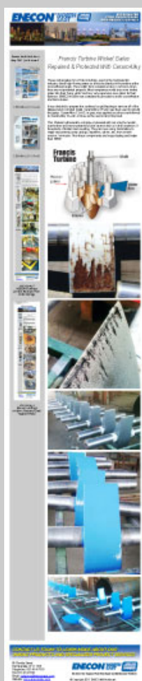
Vol 9 Issue 6 ENECON Repairs Francis Turbine Wicket Gates