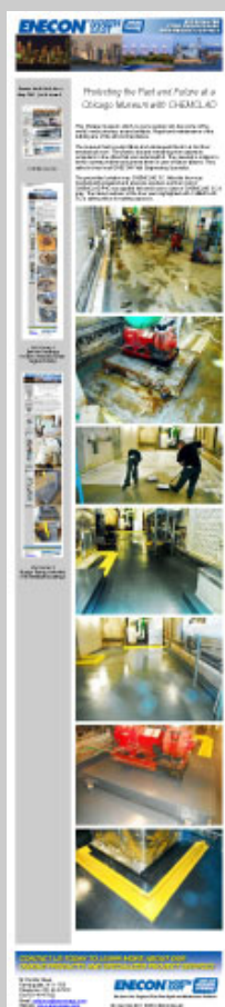
Vol 9 Issue 5 ENECON Coatings protect Museum from water damage