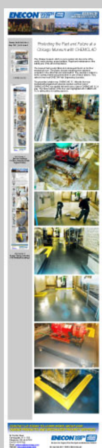
Vol 9 Issue 5 ENECON Coatings protect Museum from water damage