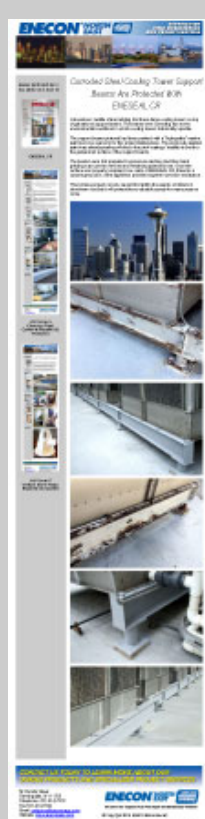
Vol 8 Issue 10 Cooling Tower Steel Beams Coated with ENECON