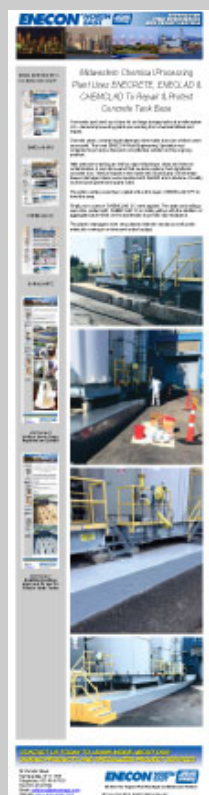
Vol 8 Issue 9 Chemical Plant Concrete Repaired & Protected