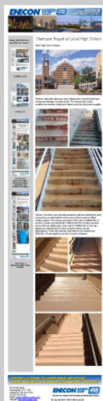
Vol 8 Issue 6 Staircase Repair at Local High School