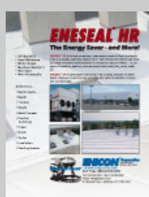
ENECON ENESEAL HR