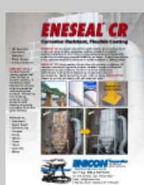
ENECON ENESEAL CR

Enecon North East News May, 2015 | Vol 7. Issue 5