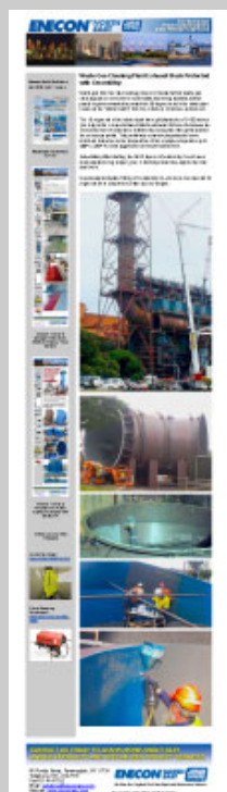
Volume 7 Issue 4 Gas Plant Exhaust Stacks Protected with ENECON