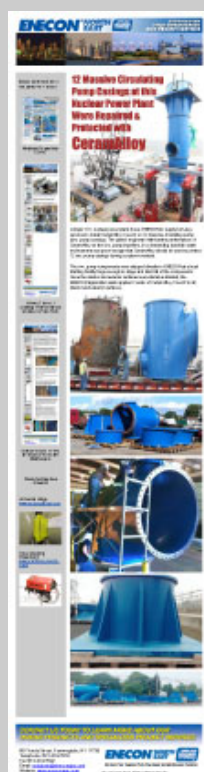
Volume 7 Issue 2 Nuclear Circ Pump Casing Protected with ENECON