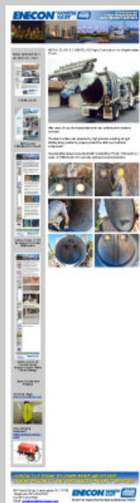
Volume 7 Issue 1 Coatings Protect Internal Surfaces of Vac-Truck