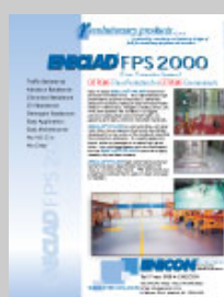
ENECLAD FPS 2000