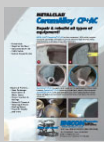
METALCLAD CERAMALLOY CP+AC