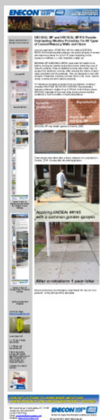
Volume 6 Issue 10: Concrete Needs Protection Before Winter Freeze Damage