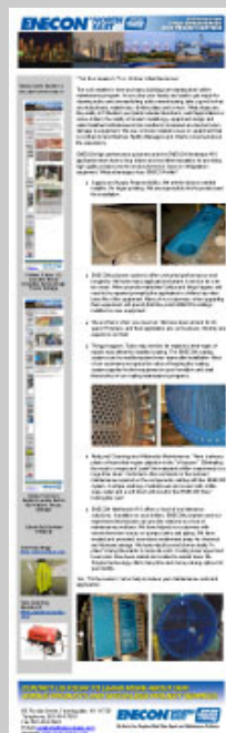
Volume 6 Issue 11 "Tis the Season" for Chiller Maintenance