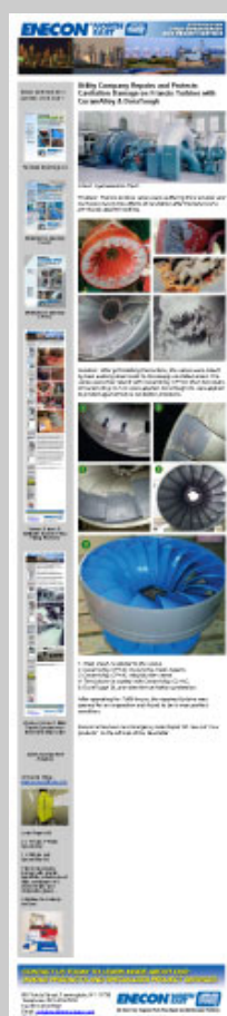
Volume 6 Issue 7: Cavitation damage on Francis Turbine solved with Enecon