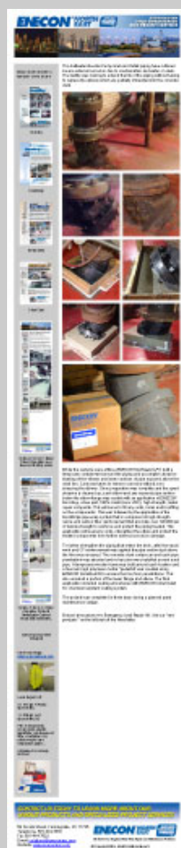
Volume 6 Issue 6: Saltwater Booster Pump Piping Restored