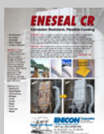
Enecon Eneseal CR

Enecon North East News Sept 2014 | Vol 6. Issue 8