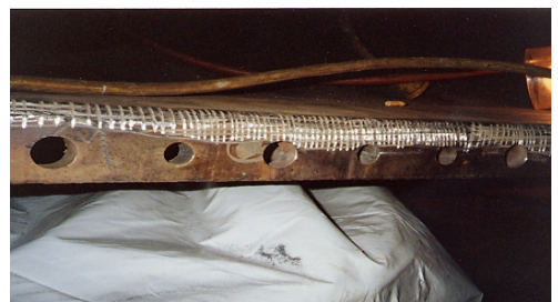
Smooth, 1/4 inch thick aluminum angle coated with ENECON