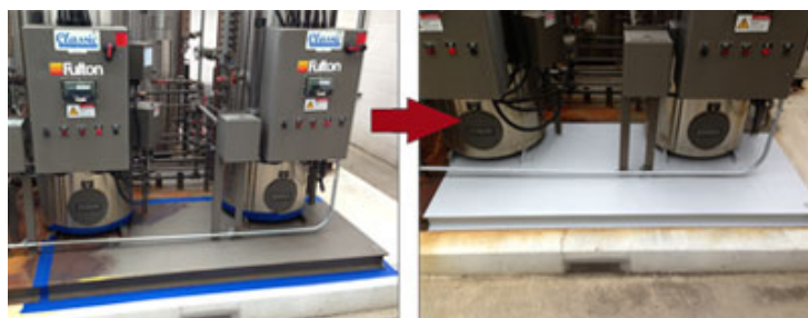
Chemical treatment process station base. Prepared by pressure washing then two coats of ENESEAL ® CR.