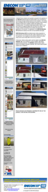
Volume 5 Issue 10: EneSeal CR Protects & Seals Corrugated Steel Roof