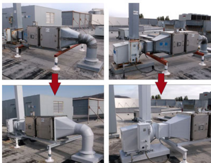
Rooftop ventilation filter station. Prepared by pressure washing the entire surface then two coats of ENESEAL ® CR were applied to prevent against future corrosion.