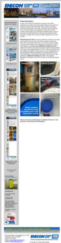
Volume 5 Issue 9: University Boiler Stack Repaired & Coated