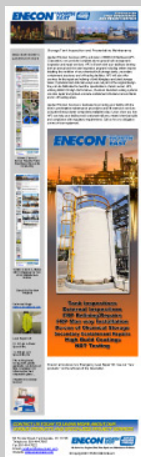
Volume 5 Issue 6: Above Ground Bulk Storage Tank Inspection & Repair