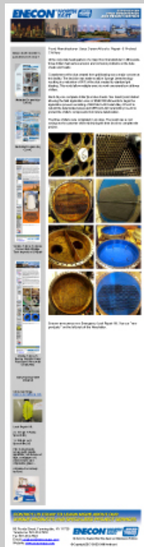
Volume 5 Issue 7: Food Manufacturer Coats HVAC Chiller