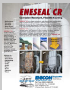
Enecon Eneseal CR

Enecon North East News April 2013 | Vol 5, Issue 4