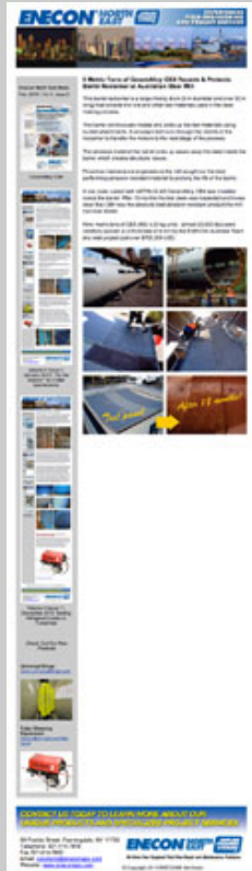
Volume 5 Issue 2, February 2013: Steel Mill Selects Enecon for Abrasion Resistance